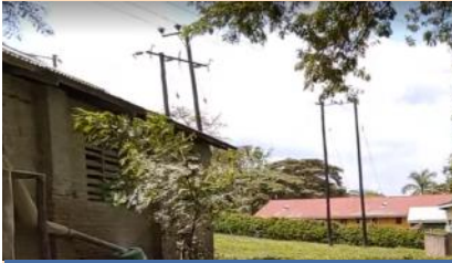
Kagando, existing electricity supply