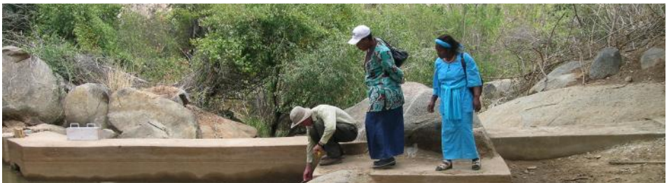
Tanzania, Pawaga. Intake for piped water supply, 2008-2011, serving 16,000 people in 8 villages on a 23km delivery pipeline at a cost of €1.2m. CED’s biggest project to date!