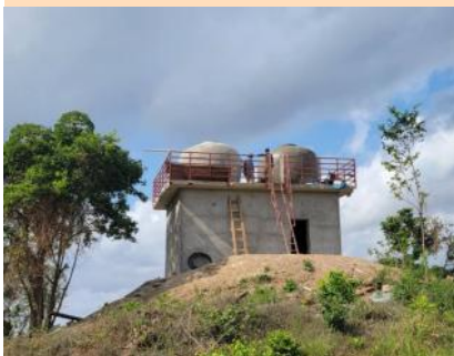
Two 10,000 litre pumpkin tanks on tower above Imani School