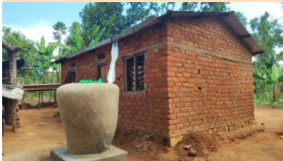
Typical 1000 litre Thai jar