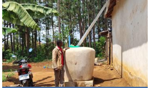
1000 litre Thai jar