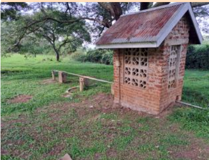
Existing borewell awaiting rehabilitation

CED are also now assisting the hospital team with a re-configuring of the water supply system for the hospital. The existing system is plagued with problems, including broken borehole pumps and a lack of storage capacity, in addition to a lack of treatment. A revised water supply design has now been agreed upon, and we are assisting with estimating the cost for this.