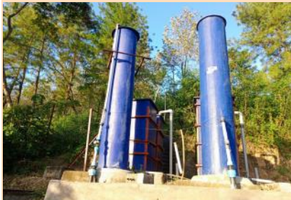
Kagando Clariwash water treatment system, awaiting recommissioning

We have continued to work with the hospital staff on the water supply. The raw water intake was destroyed by floods in May 2024, and it has not been possible to operate the Clariwash water treatment plant since then. We are hopeful that water will soon be available again, and the Clariwash system can be returned to operation.