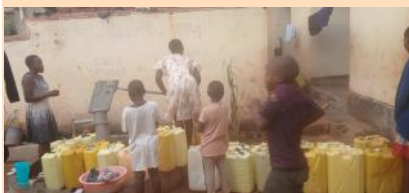
The well at God's Love School

Work was completed last October, so now there are fully functioning hand pumps at both the school and at the children's home – much to the delight of the children!