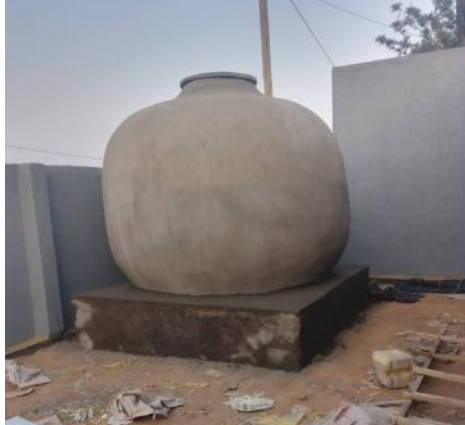
10,000 litre pumpkin tank, Kavumu

Part 1 to improve access to water at three locations, Kavumu (the new primary school and the church), Gakamba and Rukara. Kavumu and Rukara are to receive two 10,000 litre rain water harvesting tanks each and Gakamba is to be provided with a tap stand and distribution pipeline, from the government main pipe to their village 1100m away. If you’ve ever tried carrying a 20 litre jerry can of water just 20m, you’ll appreciate