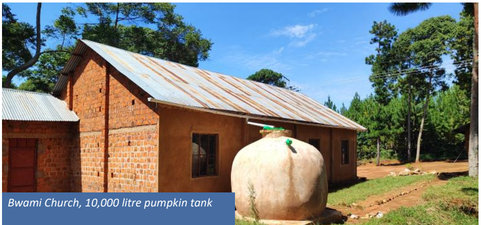
Bwami Church, 10,000 litre pumpkin tank