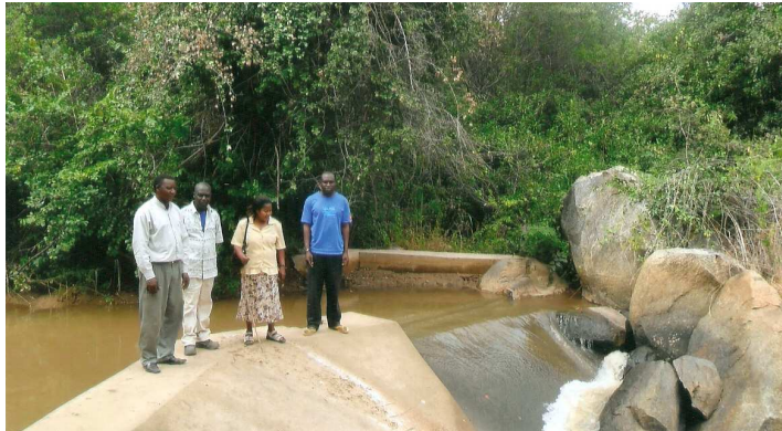
Intake weir on Little Ruaha River